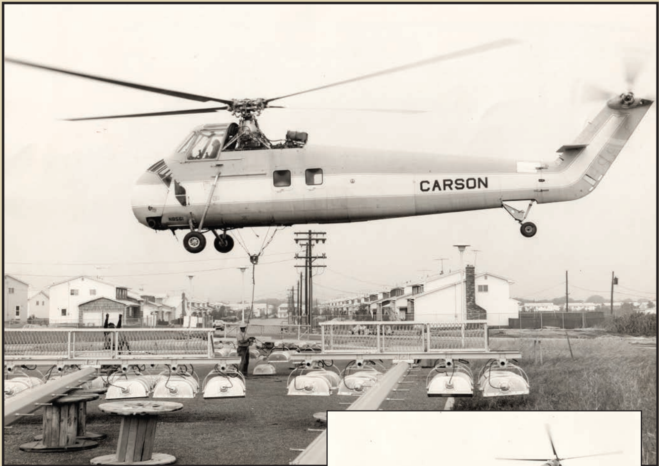
1970 SEAMAN'S NECK TOWN PARK. SEAFORD, NY